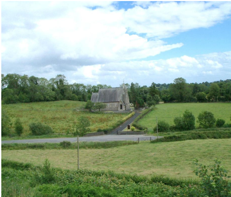
View From Site