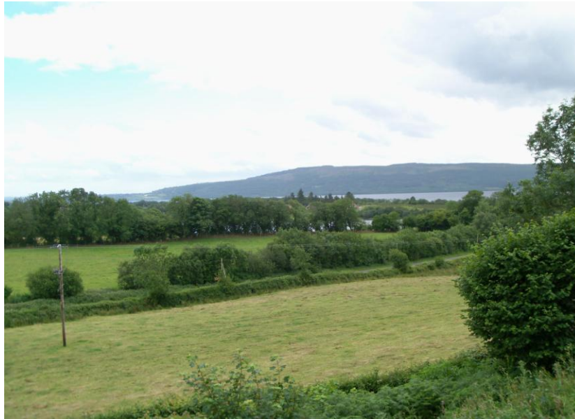
View From Site